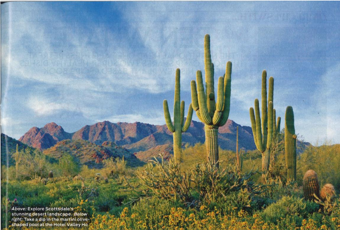
Above: Explore Scottsdale's stunning desert landscape. Below right: Take a dip in the martini olive-shaped pool at the Hotel Valley Ho

Hiking is a popular pastime and one of the best places to do this is on Camelback Mountain. As a beginner, OK! opted for the easier four-mile Gateway Loop Trail in the 30,000-acre McDowell Sonoran Preserve, where we marvelled at the different-shaped cacti and spotted wild deer and rabbits.