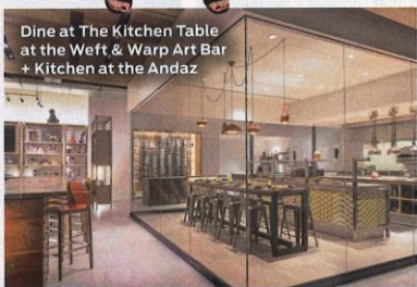
Dine at The Kitchen Table at the Weft & Warp Art Bar + Kitchen at the Andaz

The most magical way to view the spectacular Sonoran Desert is from above in a hot air balloon. OK! headed up with Hot Air Expeditions and floated across the skies, taking in the breathtaking scenery as the sun rose. It was so peaceful you could hear a pin drop. The romance of the moment spurred one couple to get engaged, and we were able to toast their good news at the champagne breakfast that ended the trip!