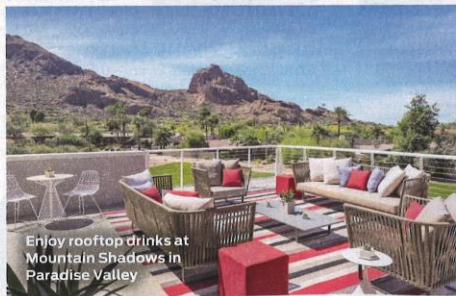
Enjoy rooftop drinks at Mountain Shadows in Paradise Valley

Elsewhere, nestled in Scottsdale's historic Arts District, the effortlessly cool Hotel Valley Ho would sit perfectly in an episode of Mad Men . The 193-room '50s hotel boasts an illustrious guest book including Marilyn Monroe, Bing Crosby, Zsa Zsa Gabor and, more recently, Drake, Hugh Jackman and Katy Perry. Our modern Tower Suite featured a kitchen, walk-in wardrobe and views of Camelback Mountain. OK! loved the martini olive-shaped pool and chill-out tunes from the resident DJ.